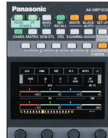
* Screen image superimposed onto device for illustrative purposes.